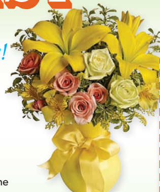
Sunny Smiles - T42-1A