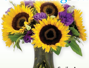
Smile Away TF-WEB12