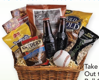
Take Me Out to the Ball Game T108-1A