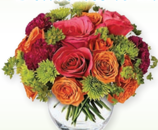
Smile for Me - TEV11-3A

Exceeding Expectations Since 1973... with Daily Deliveries to All Surrounding Towns and Nationwide!