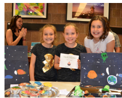
2nd Annual Cupcake competition 1st place winners

Friends of the Manville Library will be hosting its 3rd annual Cupcake Competition on Wednesday, May 8th. The competition will be held from 5 - 7pm in the Community Room at the Manville Library. Newly added this year will be entries divided into two age categories - 12 & under and 13 & over. We will be judging entries on creativity and presentation and will be offering 1st, 2nd & 3rd places in each age category.