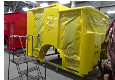
Painting the cab