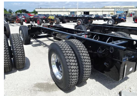
The chassis frame