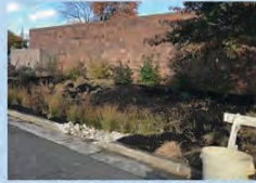
Manville's first rain garden (Manville Public Library)

Manville Community Clean-Up Day April 13 th , 2019 8:30 AM