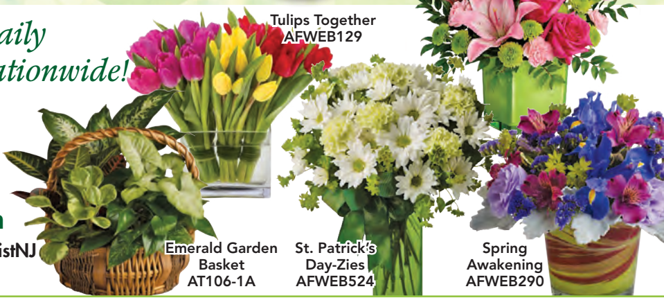
Tulips Together AFWE129