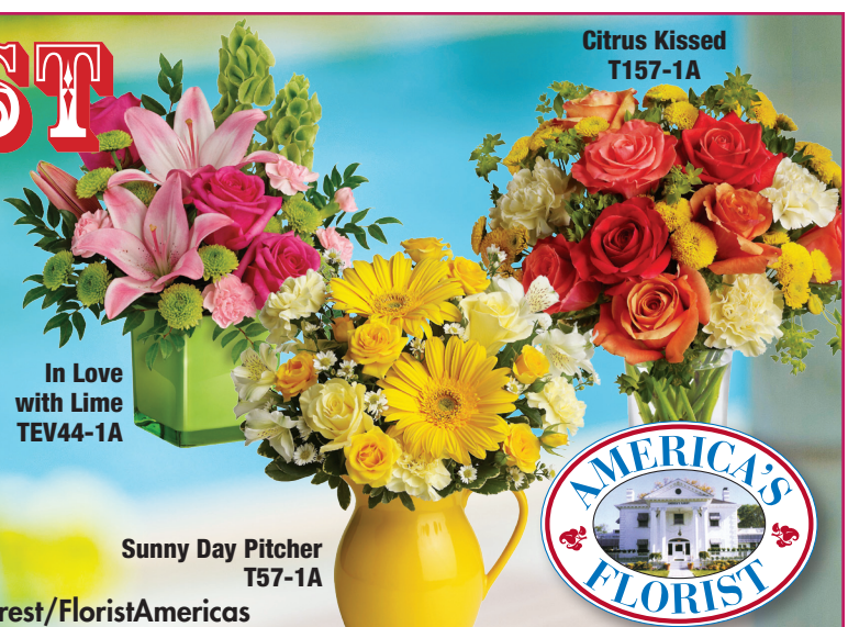
Citrus Kissed T157-1A

facebook.com/AmericasFloristNJ Pinterest/FloristAmericas