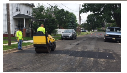
Photos: top-bottom, Milling and removal of bad section of roadway; Newly repaired area being rolled