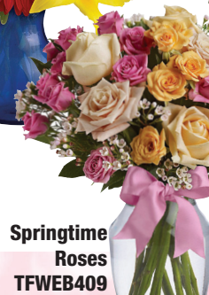
Springtime Roses TFWEB409