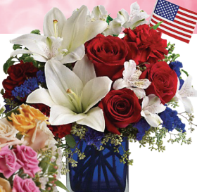
America The Beautiful AT163-2A