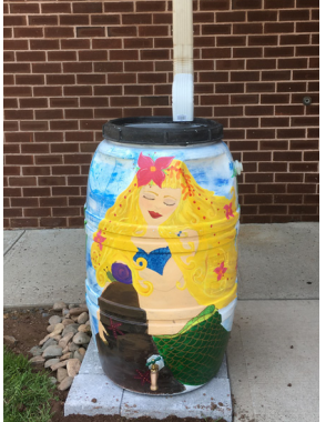
Painted Rain Barrel installed at Borough Hall

installed rain barrels will be eligible to receive rebates of up to $200. Please visit the Borough Hall or on-line at www.manvillenj.org/483/Sustainable-Manville-Green-Team or check out the SustainableManville Facebook page for more information on this rebate program! Applications are available as are installation instructions.