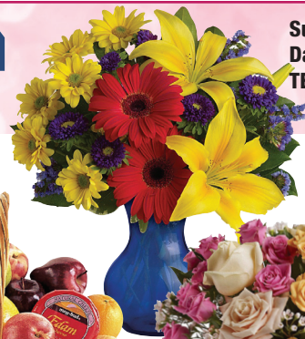
Summer Daydream TEV31-4A