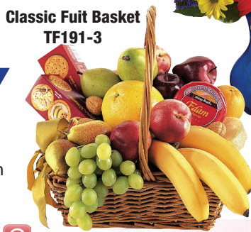
Classic Fruit Basket TF191-3

facebook.com/AmericasFloristNJ Pinterest/FloristAmericas