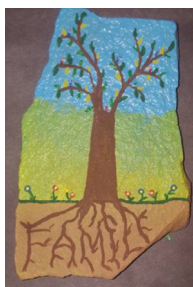
Jorge Rodriguez Rocks Arbor Day 4/27/18

include recycling and alternative energy sources.