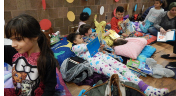
Slumber Reading Party at the Library