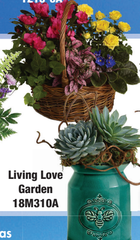
Living Love Garden 18M310A