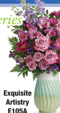
Exquisite Artistry E105A