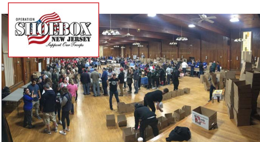
The VFW held an Operation Shoebox on February 10th to benefit our active military. It was a great turnout of volunteers to help package up items to send our troops a bit of home.

All trips are open to the public. Trip brochures can be viewed on our Facebook page.