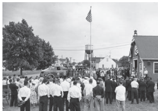
Is the fire truck being blessed? Is it a ground breaking for the new building?