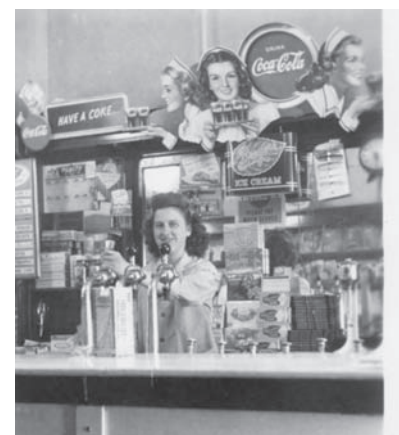
Do you know who the woman is behind the soda fountain, the name of the store and when this might have been taken?