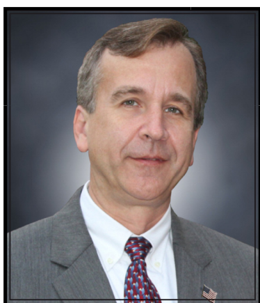
Mayor Onderko's Corner Richard M. Onderko, Mayor Borough of Manville