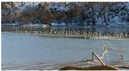
Winter along the Raritan River

As an environmental economist, I spend my time thinking about natural assets – like