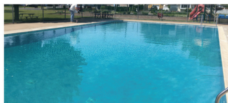
Cooper Park Pool in Lost Valley