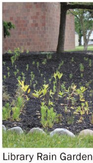
Library Rain Garden