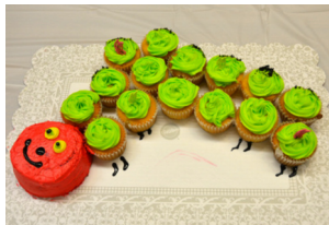
2017 Prize Winner